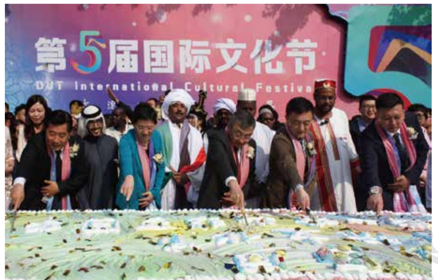
DUT International Cultural Festival