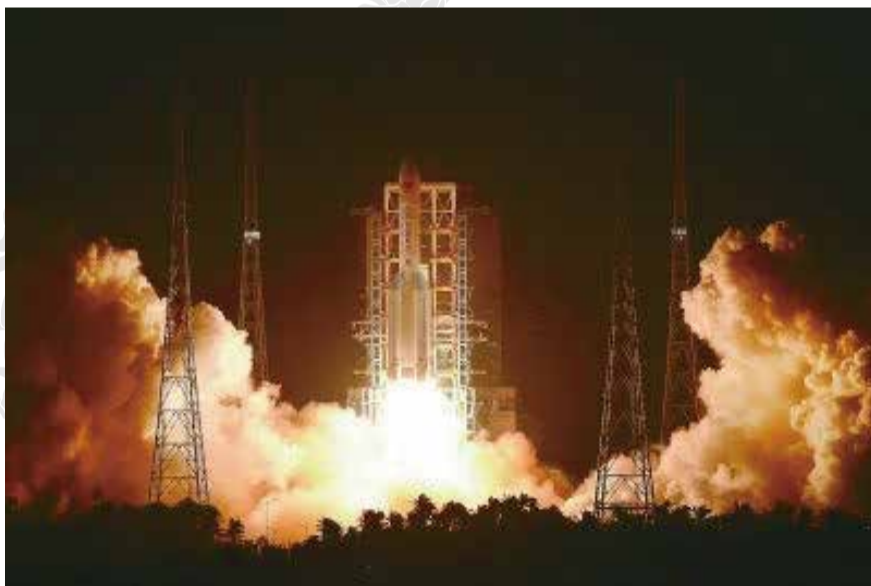
Long March 5 Series Launch Vehicle

DUT has three campuses (Lingshui, Development Zone and Panjin) in two beautiful coastal cities (Dalian and Panjin, both in Liaoning Province). It covers a total area of 4.262 million square meters with a construction area of 1.68 million square meters. The university library has a collection of more than 3,668,000 books and over 58,000 Chinese and foreign electronic journals. The existing