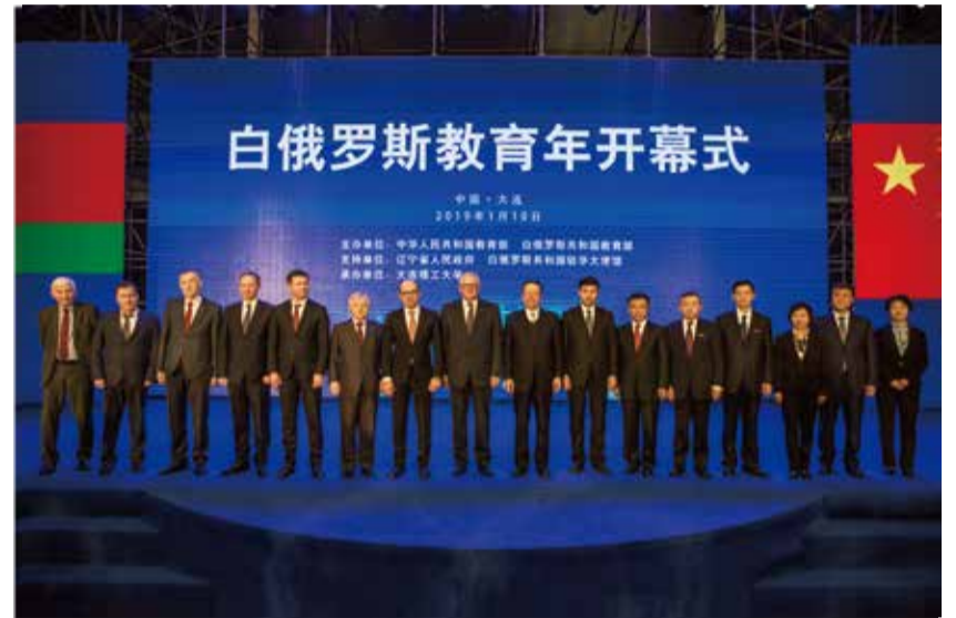
the Opening Ceremony of "Belarus Education Year"

Internationalization is one of the most important development strategic goals for DUT. In recent years, it has achieved gratifying results in international cooperation and exchanges. DUT has now established long-term stable collaboration with 252 universities in 35 countries and regions, joining in 17 international organizations and alliances including Excellent 9 and Sixers which is started by DUT. In order to enhance students' international vision and academic capability, the university actively expands over 150 overseas exchange programs, dispatching nearly 7000 students to have overseas exchanges in recent three years. By the end of 2019, there are 1611 international students studying at DUT. Between 2016 and 2019, the university has employed 3415 long-term and short-term foreign experts. In 2019, 19 national foreign cultural and educational expert projects has been approved. Meanwhile, 1710 faculty members and staff visited countries and regions out of mainland China, participating in long-term programs (such as CSC visiting scholar program) or short-term visit and conferences, etc..