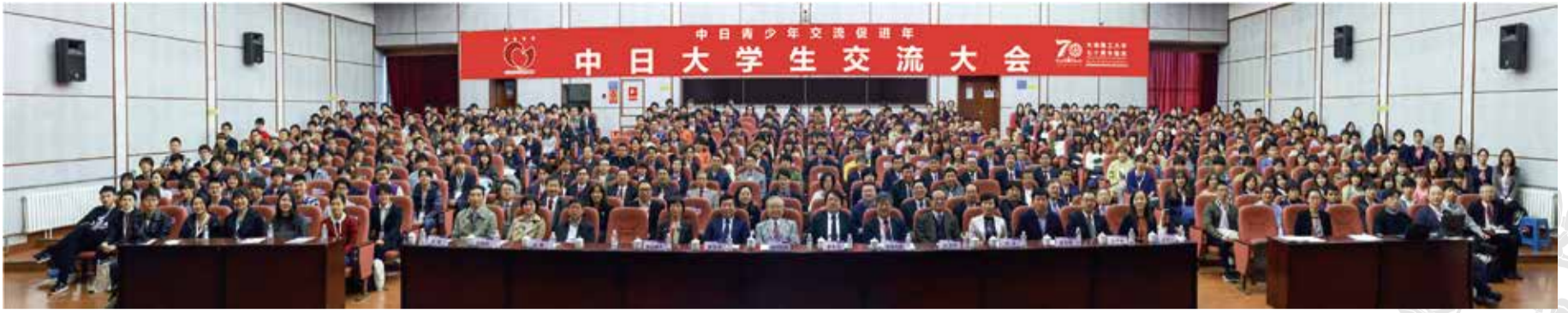
Sino-Japanese Student Exchange Program

Internationalization is one of the most important development strategic goals for DUT. In recent years, it has achieved gratifying results in international cooperation and exchanges. DUT has now established long-term stable collaboration with 252 universities in 35 countries and regions, joining in 17 international organizations and alliances including Excellent 9 and Sixers which is started by DUT. In order to enhance students' international vision and academic capability, the university actively expands over 150 overseas exchange programs, dispatching nearly 7000 students to have overseas exchanges in recent three years. By the end of 2019, there are 1611 international students studying at DUT. Between 2016 and 2019, the university has employed 3415 long-term and short-term foreign experts. In 2019, 19 national foreign cultural and educational expert projects has been approved. Meanwhile, 1710 faculty members and staff visited countries and regions out of mainland China, participating in long-term programs (such as CSC visiting scholar program) or short-term visit and conferences, etc..