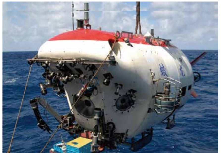
Jiaolong Manned Submersible

DUT has three campuses (Lingshui, Development Zone and Panjin) in two beautiful coastal cities (Dalian and Panjin, both in Liaoning Province). It covers a total area of 4.262 million square meters with a construction area of 1.68 million square meters. The university library has a collection of more than 3,668,000 books and over 58,000 Chinese and foreign electronic journals. The existing