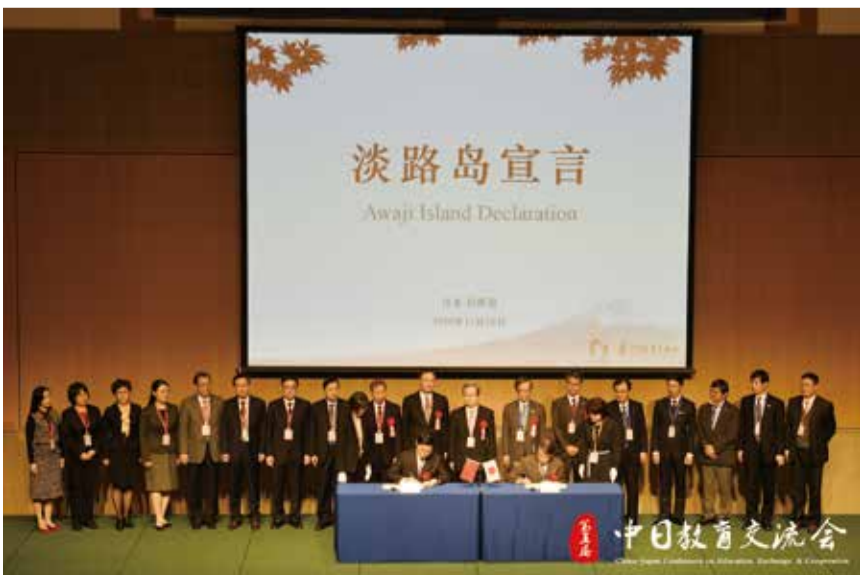
Excellent 9 and Sixers signed The Awaji Island Declaration

DUT has held many international activities at various levels and on different scales. We warmly welcome our old and new friends to work together with DUT in international cooperation and exchange for win-win development!